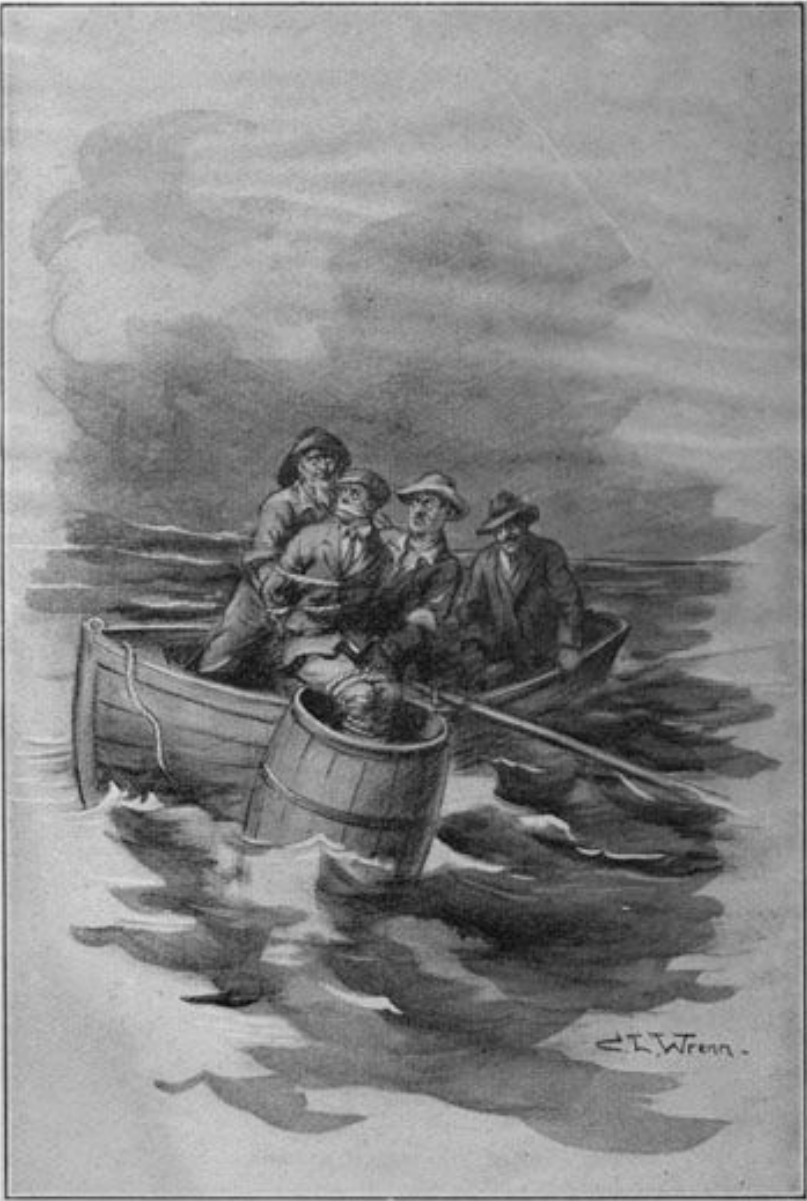
FRANK WAS LIFTED BE MAIN FORCE AND PLACED IN IT. — Page 113.