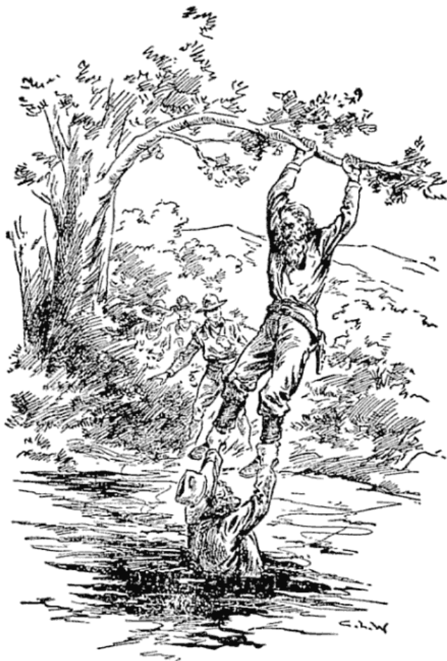
The professor seized Zeb's boots with the grasp of a drowning man.

The professor lightened his grip and slowly, hand over hand, Zeb began the slow journey back along the branch. It was a feat only possible to a man whose muscles were of iron. And before it was over even Zeb was almost overcome. Perspiration streamed from his forehead and soaked his shirt as he dropped from the branch, having accomplished the journey and pulled the professor to the bank.