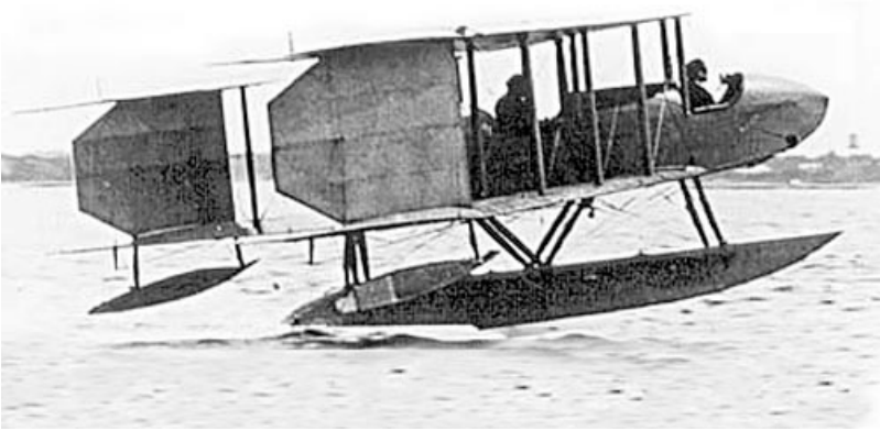
During the preliminary run along the water the waves drenched both of the boys.