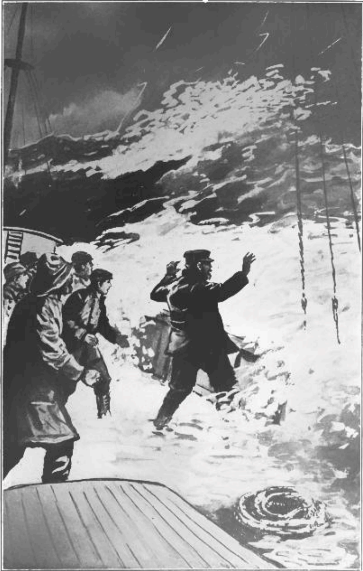
“The Hatches Were Open and They Rushed On Deck.” — Page 178